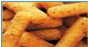
192 sticks per case

40700 Breaded Mozzarella Sticks .73¢ per serv of 4 4/3 lb. bags ( $34.95 cs )