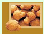
Poppers Breaded Jalapeño Cheese Ravioli Battered Pickle Chips Jalapeno Poppers Cr Ch Mozz Sticks Mushroom

40700 Breaded Mozzarella Sticks .73¢ per serv of 4 4/3 lb. bags ( $34.95 cs )